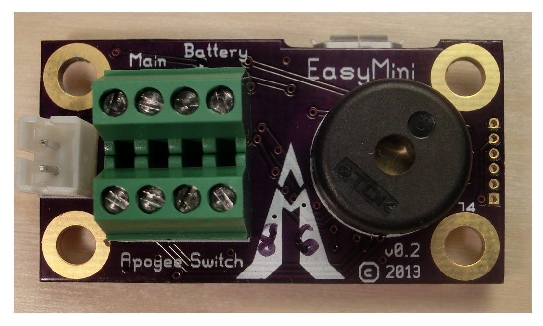
Figure 4.1. EasyMini Board

EasyMini is built on a 0.8 inch by 11/2 inch circuit board. It's designed to fit in a 24mm coupler tube.