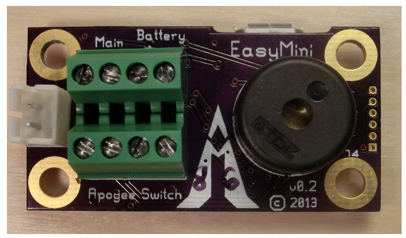
Figure 1. EasyMini Board

EasyMini is built on a 0.8 inch by 1½ inch circuit board. It's designed to fit in a 24mm coupler tube.