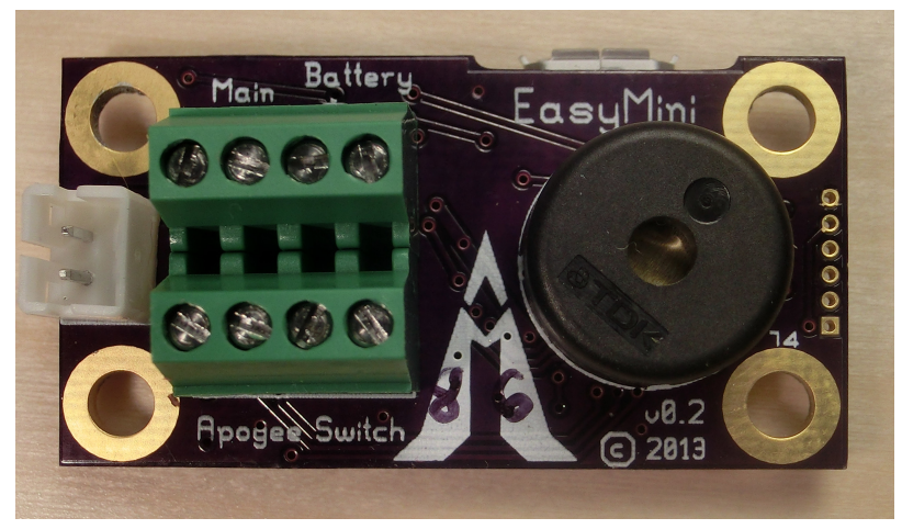
Figure 1. EasyMini Board

EasyMini is built on a 0.8 inch by 1½ inch circuit board. It's designed to fit in a 24mm coupler tube.